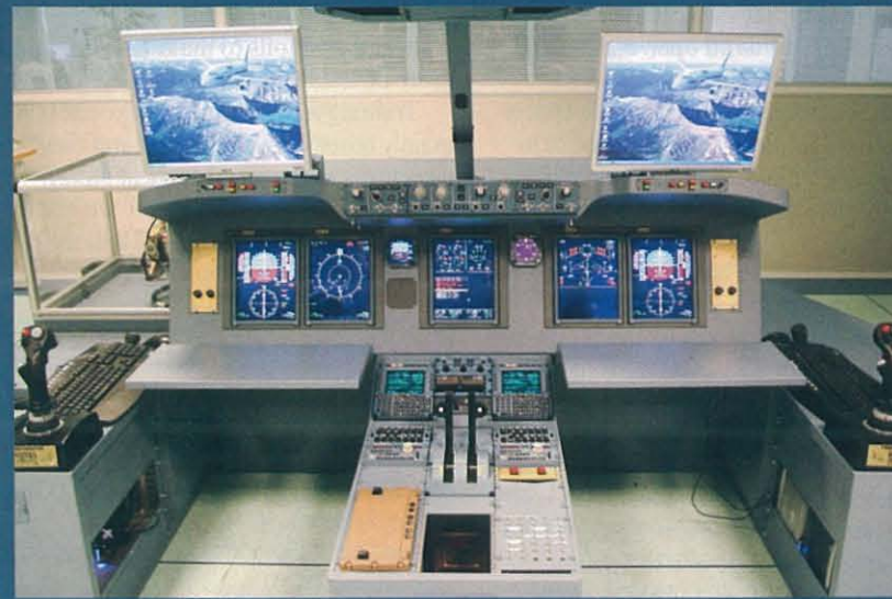
(Top) Flight deck of the new Sukhoi Superjet 100 regional jet with Thales avionics suite was inspired by the cockpit layout of the Airbus A380. (Bottom) One of the two systems integration benches used by Thales in Toulouse, France. One bench was to be moved to Moscow by the end of the year.

The development, production and testing efforts are ramping up accordingly. Alenia Aeronautica has taken a 25 percent stake in Sukhoi Civil Aircraft Co. (SCAC) and will set up a joint venture in Italy to provide marketing and after-sales support outside Russia and the Commonwealth of Independent States. Boeing has expanded its long-standing consultancy role. Airframes are under assembly at Komsomolsk-on-Amur in the Russian Far East and undergoing tests by TsAGI, the Central Aerohydrodynamic Institute, at Moscow's Zhukovsky air base. The PowerJet joint venture of Snecma and Russia's NPO Saturn is building and testing SaM146 engines in Rybinsk.