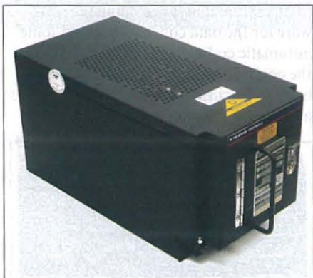
Integrated Flight Data Management Unit supplied by Teledyne Controls

To help ensure the technology used represents the state of the art, Thales has recruited a 17-strong panel of pilots, including two of its own pilots and others from Air France, its subsidiaries Regional