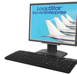
LoadStar ® and LSE

Teledyne Controls' Portable Maintenance Access Terminal 2000 (PMAT 2000 ® ) system is a rugged flightline maintenance support tool that performs the following functions: